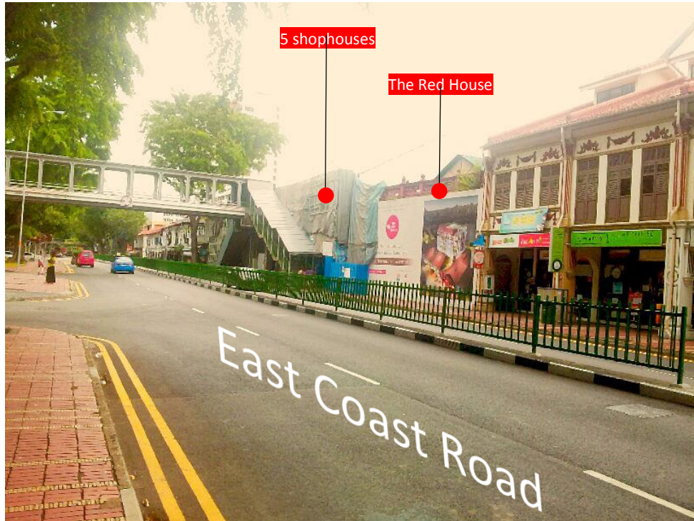
View of The Red House and five shophouses taken from opposite side East Coast Road.

Current view of The Red House Development.