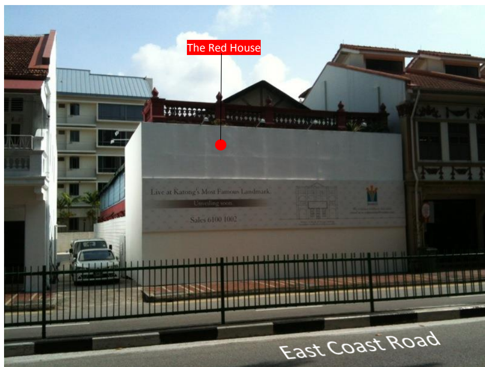
View of The Red House taken from opposite side East Coast Road.